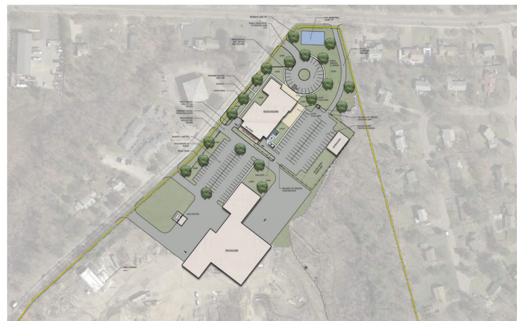
19021.00 MARSHFIELD POLICE STATION CONCEPTUAL SITE PLAN OCTOBER 06, 2014